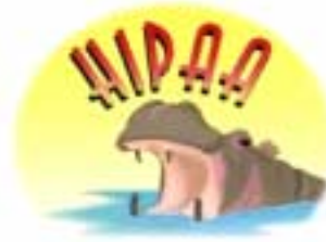
HIPAA AND YOU!

With this publication, Wyoming's Office of Medicaid and the Department of Health will provide members with the latest information on HIPAA regulations and compliance, including detailed overviews of specific requirements for providers and implementation tips and Web site resources. If you would like to receive a copy of the HIPAA NEWS, please e-mail us at hipaa@state.wy.us and ask that your name be added to the mailing list. Copies can also be downloaded from the ACS Wyoming Medicaid website: http://wyequalitycare.acs-inc.com/ .